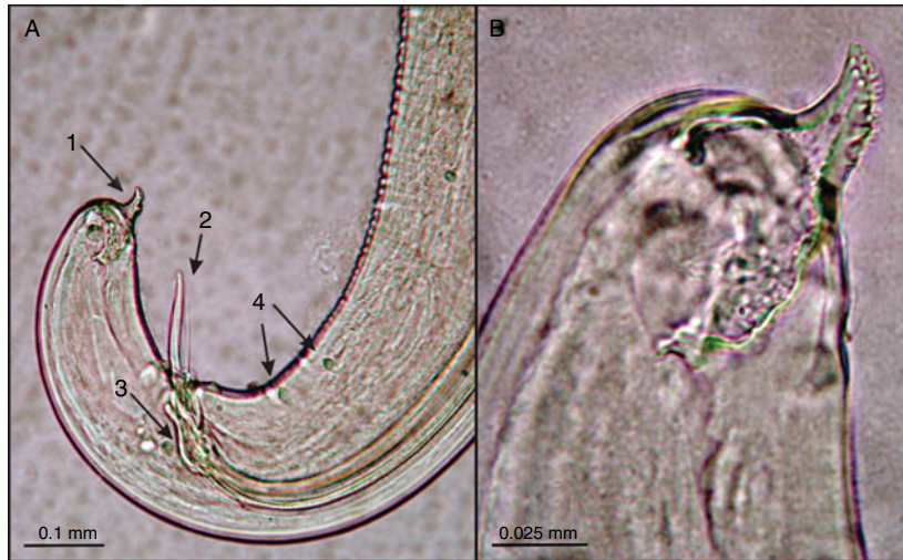
Fig. 3. (colour online). Posterior extremity of a male of Cucullanus tucunarensis n. sp. showing (A) sclerotized structure (1), spicules (2), gubernaculum (3) and caudal papillae (4); (B) sclerotized structure.